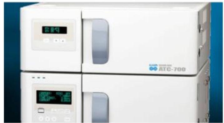
HPLC-ECD Component System, 700 Series