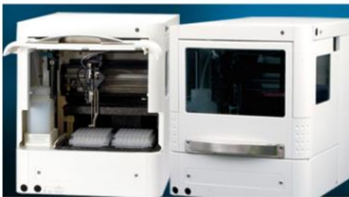
HPLC Autosampler "INSIGHT"